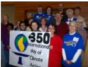
MUUSJA supports substantive carbon reduction goals.

We turned out for HIRE's Rally for Green