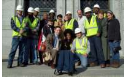
HIRE MN advocates at the state Capitol

Most importantly, HIRE secured groundbreaking legislation providing $2.5 million for green jobs training for low-income people and for outreach programs.